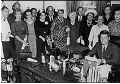
Pres. Kennedy signing EPA