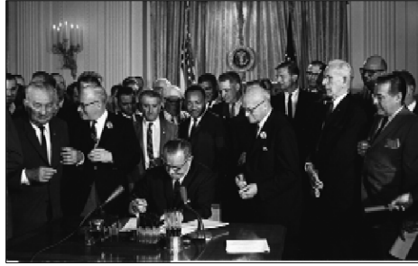
Pres. Johnson signing Title VII