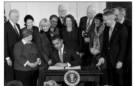
Pres. Obama signing Ledbetter Act