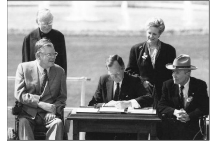
Pres. G.H.W. Bush signing ADA